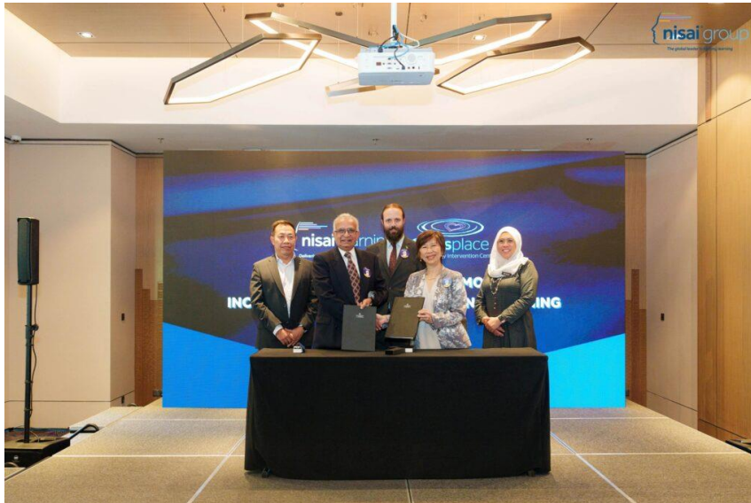
Image 2 - MOU signing between Nisai Learning and Oasis Place.

The collaboration between Nisai Group and Oasis Place is a strategic effort to integrate quality education with necessary interventions, providing SEN students with tailored support.